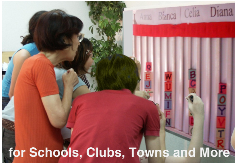
for Schools, Clubs, Towns and More

Funding and Policies Match Voters' Spread and Center